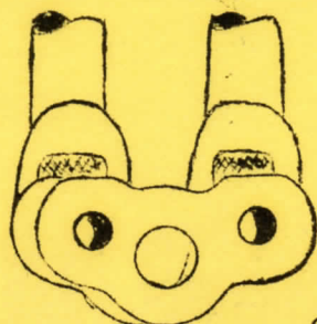
OIL HOLES CLOSED OFF